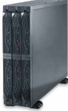
3 106 64

The main parameters of the UPS, including the battery charge level and faults, are displayed on the LCD screen on the front panel. The integrated communication software not only controls the UPS and its switch-off if there is a malfunction, and enables the user to test the main functions remotely, communicate via SNMP/Internet/network adaptor and access the functions of the UPS via the Internet, but can also send the user an SMS if specific events occur.