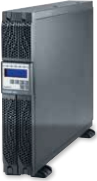
3 101 40