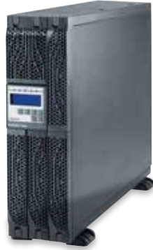
3 101 77