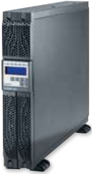
3 101 74